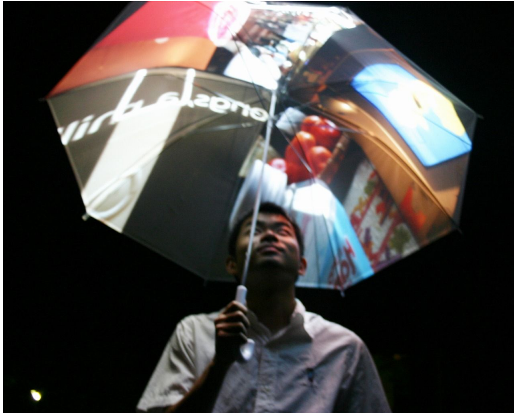
The Umbrella Photo Browser to Relay Experiences in Rainy Days