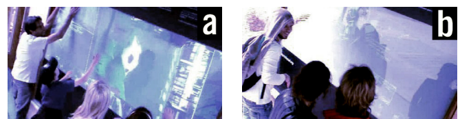
Figure 9. Social interaction inspired by conflicts

the woman places her hands in front of her chest making her withdrawal clearly visible to the other team.