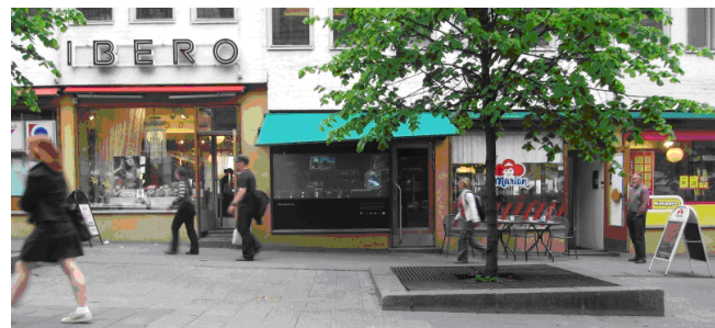
Figure 2. CityWall installation in Helsinki, Finland.

than two points (e.g. by two hands or two fingers of the same hand) and then either rotating the two points around each other or altering their distance.