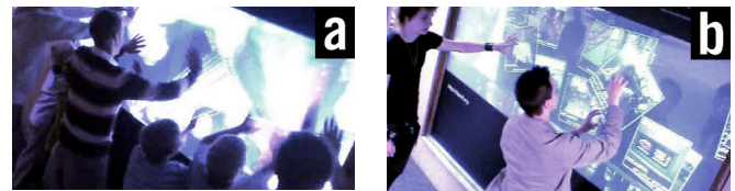
Figure 6. Parallel use

Two baseline patterns of multi-user interaction were observed. Firstly, in parallel use , people can occupy an area of the screen and focus on their own task irrespective of the