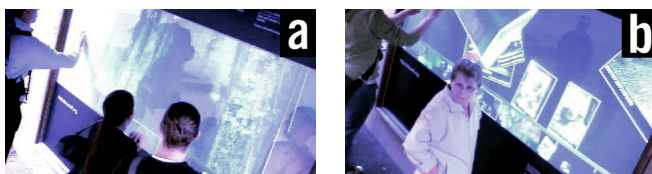
Figure 8. Conflict management by withdrawal

In Figure 8a, the activities of the two groups conflict when the man on the left accidentally blows up a photo so that it goes on top of the photos that the group on the right was working on. They both turn their gaze towards the other group, and pull their hands out from the screen. In addition,