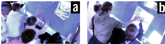
Figure 7. Teamwork

Teamwork is sometimes also a way of dealing with physical obstacles, or it can be adopted because it is more fun that way, or both. In Figure 7b, the two men are both holding a can of beer in their hand and, because of that (or inspired by it), they start scaling up the photo each grabbing one corner. Although CityWall was designed to enable two-hand usage, we observed many people using it with one hand only. As two-hand usage was not enforced (all moving, zooming and panning activities could also be done one handedly), this may have something to do with personal preferences, but not always. Not unusually was one-handedness due to a physical obstacle, as in the example above. It appears that people in downtown Helsinki are carrying all sorts of bags, skateboards, cameras, mobile phones or other items.