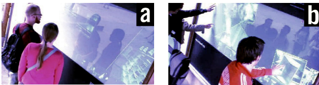
Figure 5. Stepwise approach to the wall

ply that seeing people using the display served as an attractor for more users.