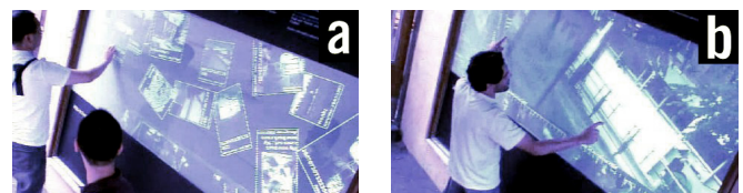
Figure 11. Leaving a mark

There are several ways of leaving a mark. At exit, people can, for instance, give momentum to the timeline or desktop so that photos fly there for a moment, or they can select a funny or embarrassing photo to leave on top.