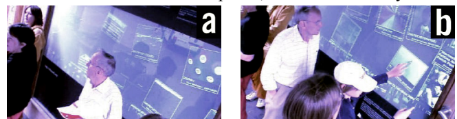
Figure 4. Shelter from the rain

The presence of other users is important to the way new users arrive at the display. In 19% of the cases, CityWall was already in use by someone else when a new user entered the display and started using it. Given that the display was in use 8.8% of its total uptime, this indicates very sim-