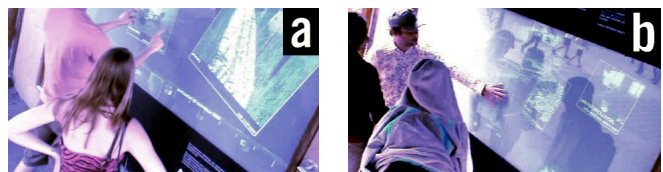
Figure 12. Teacher-apprentice setting

Content on the wall and features of the interface were used as resources to coordinate the activity and to create events