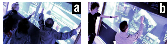
Figure 10. Pondering grip vs. grandiose gestures

In Figure 10a, the woman on the left is carefully moving objects around the left side of the wall. In contrast, the couple on his right is performing scaling up with grandiose gestures, on the verge of entering her personal space. In Figure 10b, the man on the left is holding a photo in his hand, keeping it in constant small movement, waiting for