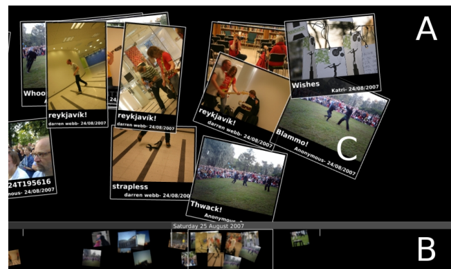
Figure 1. Screenshot of CityWall with Flickr content.

Interaction with the top part (A) of CityWall follows two interaction paradigms. Moving, scaling and rotation of content (C) follows direct manipulation principles: a user can grab an image by putting a hand on it. The photo follows the hand movements when the user shifts her hand. Rotation and scaling are possible by grabbing the photo at more