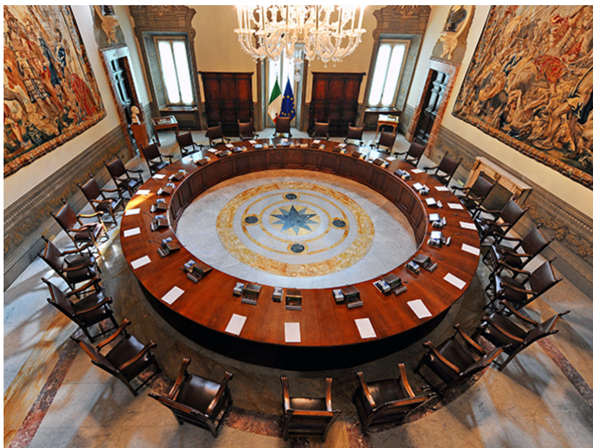
The Italian Council of Ministers

Italy has an updated national bioeconomy strategy: “Bioeconomy in Italy: A Unique Opportunity to reconnect Economy, Society and the Environment”. It has been officially presented this morning in Rome, at the Presidency of the Council of Ministers, by the Italian government, with the presence of Waldemar Kütt representing the European Commission and Philippe Mengal, Executive Director at BBI JU.